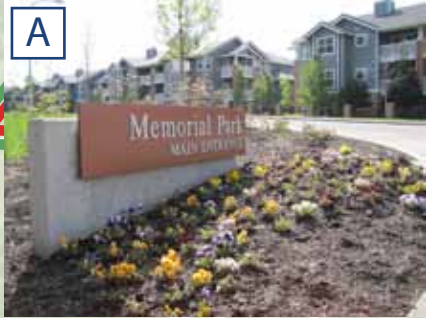
Entrance to Memorial Park