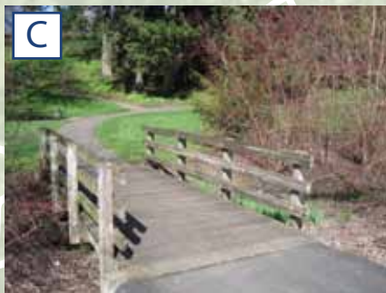
Trail connecting to loop