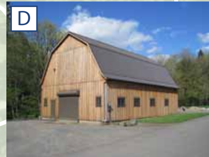
Turn left just past this barn