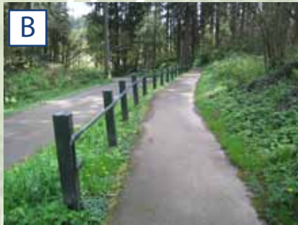
Walking trail just past entrance to park