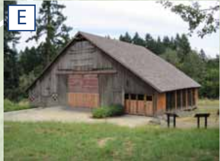
The Stein-Boozier Barn