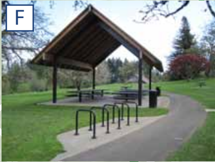
Picnic shelter along pathway