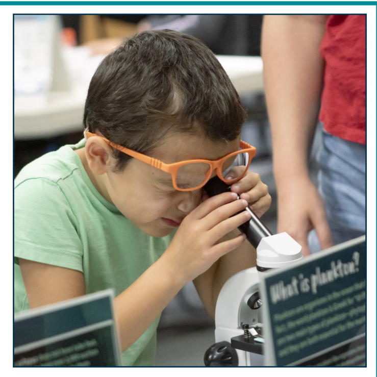
A young patron looks through a microscope at the UO Natural and Cultural History Museum's program "Journey Under the Sea" on Aug. 6.

Regular children's programs return in September, including Baby & Toddler Time, Family Storytime, and Play Group.