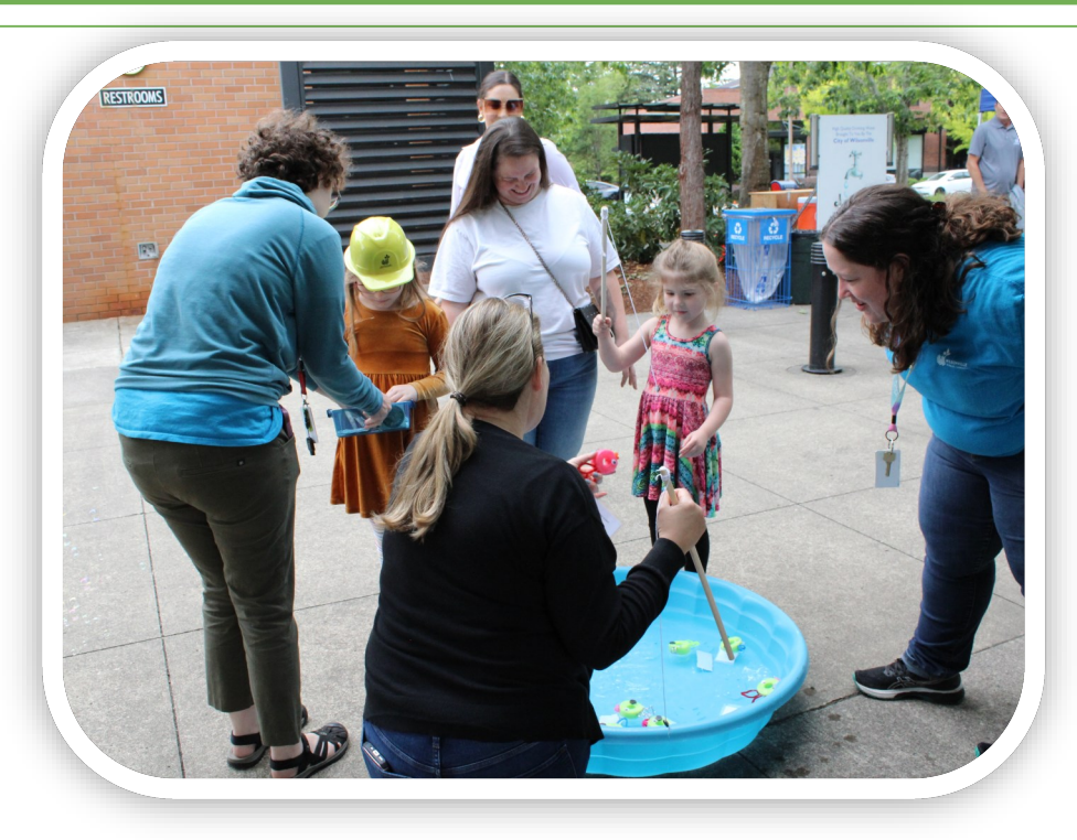
Library staff assist guests with a fishing game in front of the library booth at the City of Wilsonville's "Party in the Park" on Aug. 22.