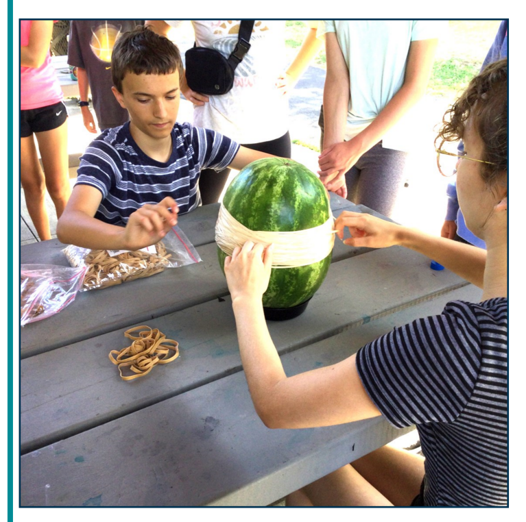
Teens wrapped rubber bands around a watermelon until it exploded at the final Teen Summer Reading Program event.