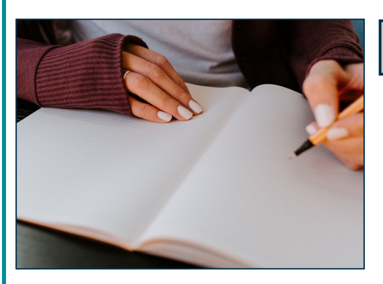
The annual Short Story Contest accepts stories of 1,500 words or less by writers of all ages, from toddlers through adults.