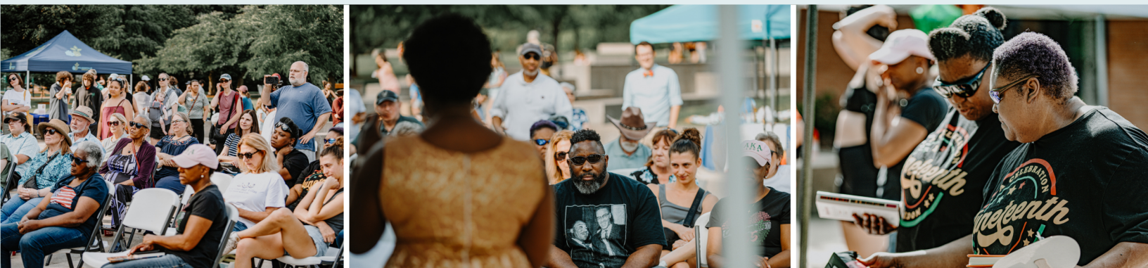
Attendees listening to 2024 Keynote address (left, middle) and enjoying book giveaways (right).