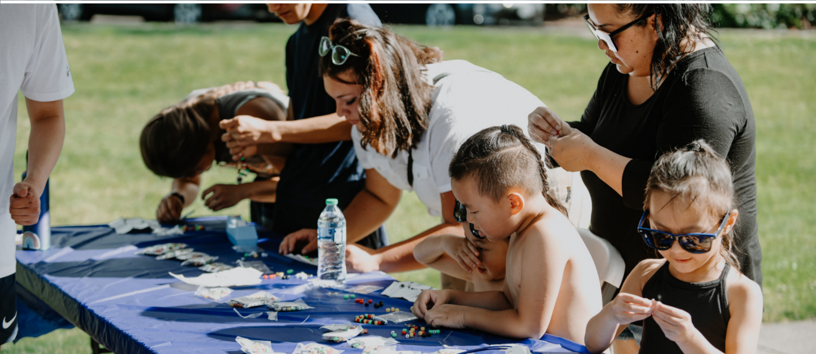
Attendees partaking in a bracelet-making activity (2024 Event).