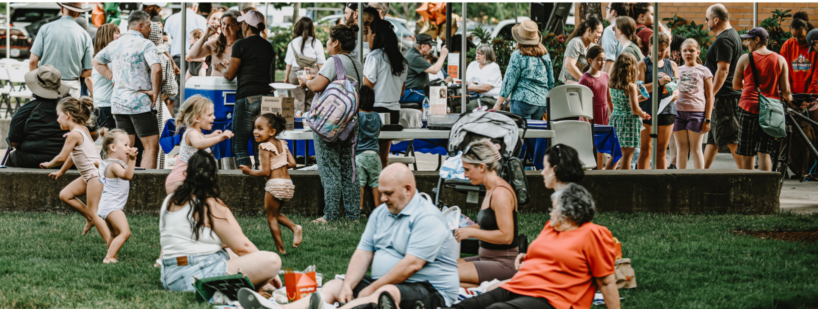
Attendees enjoying the 2024 Juneteenth Event.