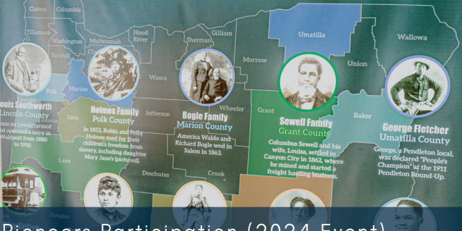
Oregon Black Pioneers Participation (2024 Event).

Oregon Black Pioneers, founded in Salem in 1993, researches, recognizes, and commemorates the culture and heritage of African Americans in Oregon. We are the only organization in Oregon dedicated to preserving and presenting the experiences of African Americans statewide. We use the term pioneers to mean not only people who moved to Oregon in covered wagons, but also people who were pioneers in their communities or professions.