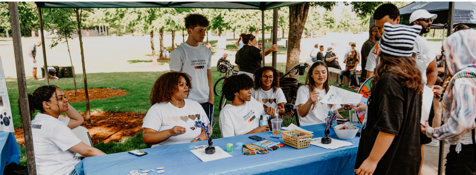
Wilsonville High’s Black Student Union at the 2024 Juneteenth Event.

We are hoping to build on this momentum, and to continue to offer free music, food and educational materials. To make this possible, we are seeking generous support from the Wilsonville community.