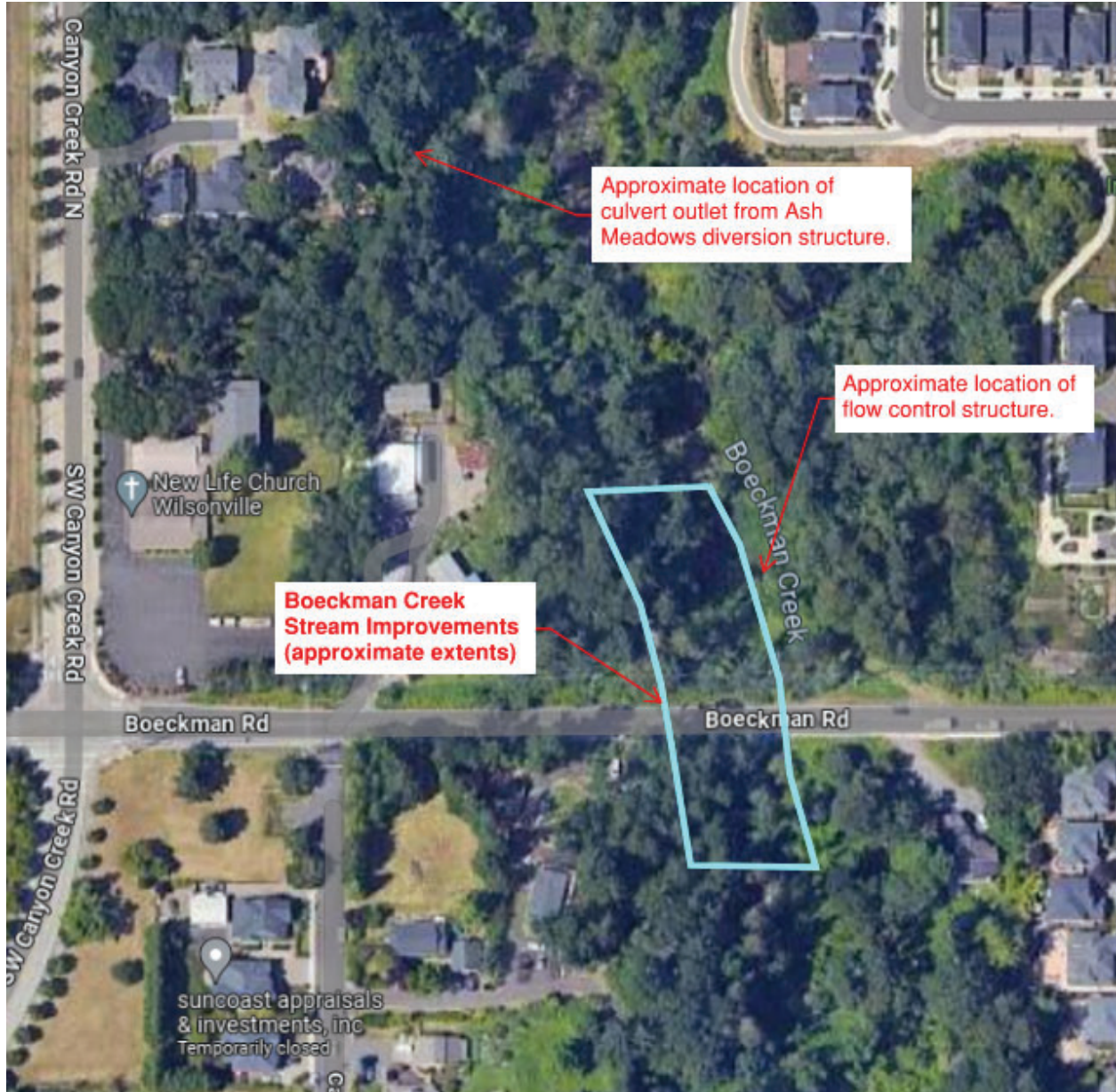
Figure 1. Project extents for Boeckman Creek stream restoration design and bidding services (Phase 2).

BC understands that the stream restoration design was updated to the 60 percent level, while all other design components were updated to the 90 percent or 100 percent level. Task 15 provides further detail.