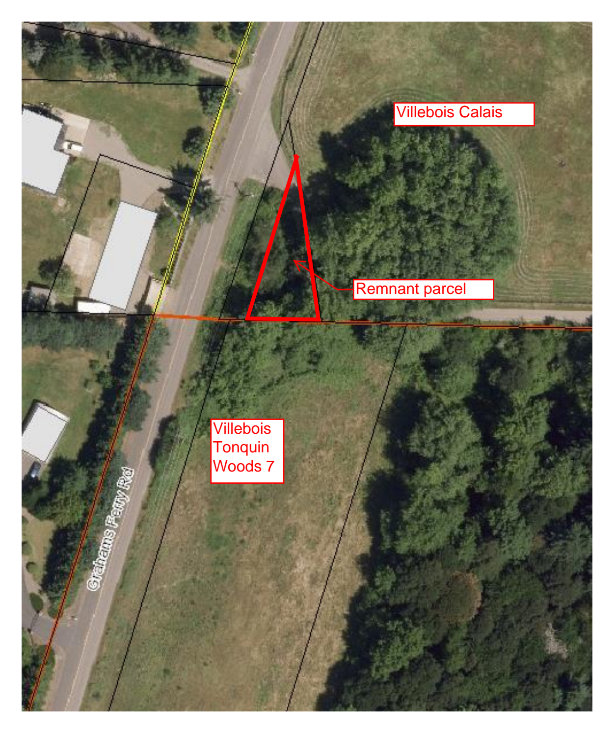
Tax Lot 3S-1W-14BD #01503