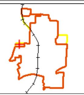
Scale 1:2,000 1 in = 167 ft