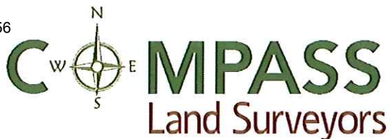
EXHIBIT A LEGAL DESCRIPTION

RIGHT OF WAY ACQUISITION CIP #4197, XEROX-PARKWAY AVE. ROW ACQUISITION PROJECT TAX LOTS 200 AND 290, CLACKAMAS COUNTY ASSESSOR'S MAP 3 1W 11 PAGE 1 OF 2