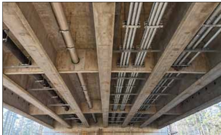
Construction of the new Boeckman Bridge provided an opportunity to underground several utility lines, water lines, and storm pipes.