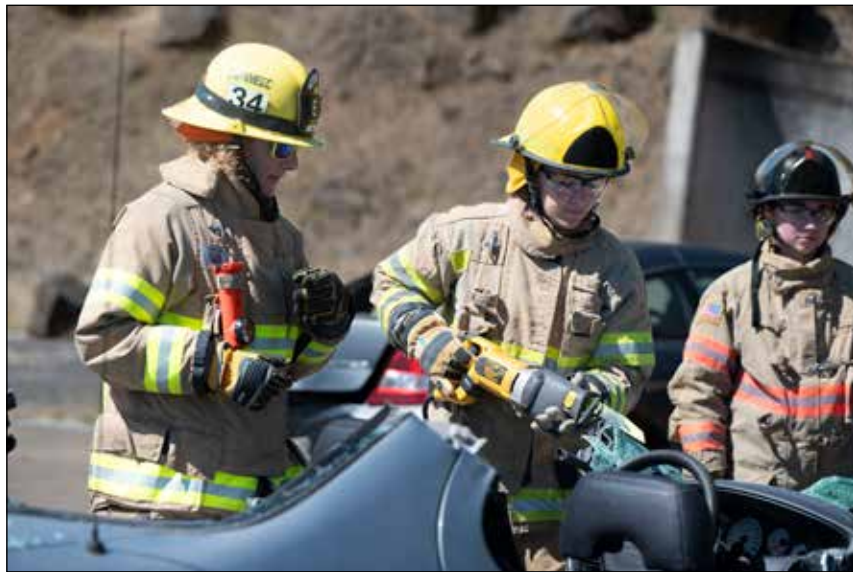
Portland Metro Fire Camp, June 20-22, provides a thorough introduction for young women considering a career in firefighting.