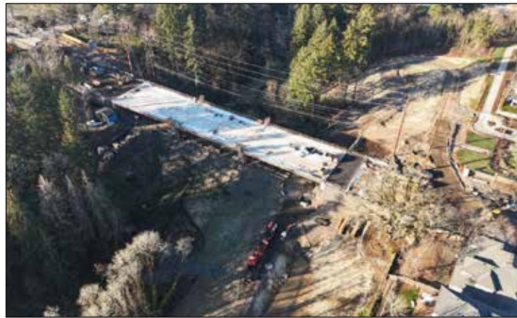
This birds-eye view looks north at Boeckman Road, where the Boeckman Bridge foundation, girders, diaphragms, abutments, and deck are now complete.