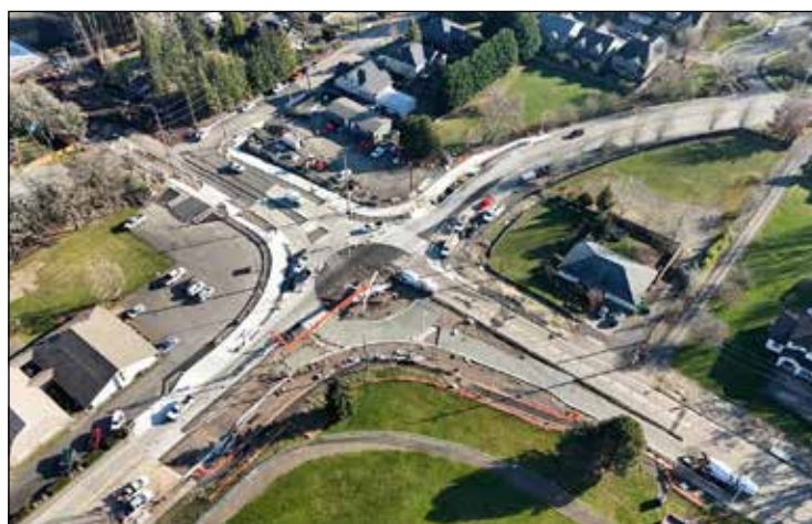
This overhead look from the northwest shows progress on the new roundabout under construction at the intersection of Canyon Creek Rd. and Boeckman Rd.