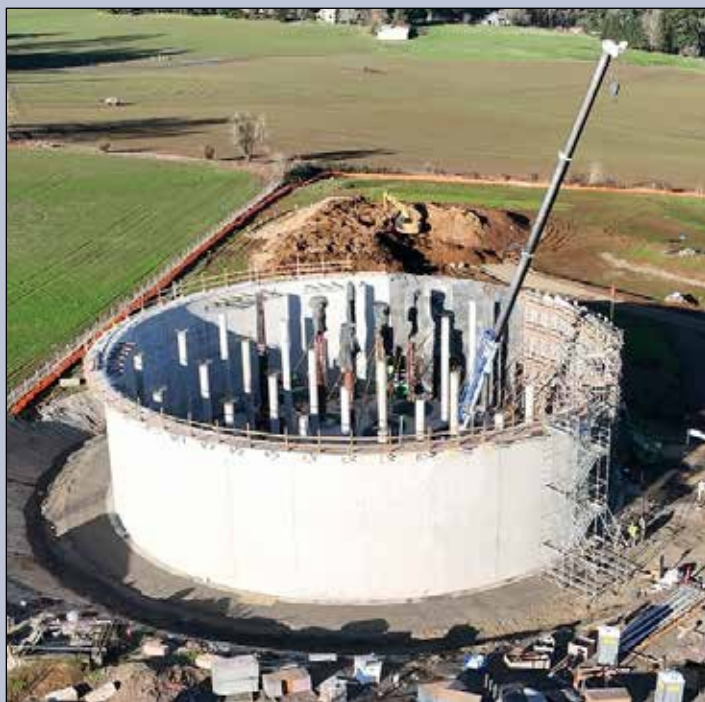
The site is large enough to accommodate future system improvements as needed.

Upon completion, the project improves the City's water storage and delivery capacity, and provides additional water for everyday use and emergencies.